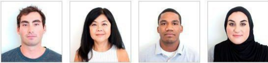
Photo IDs will be mailed to the address on file in the advising office.