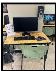
One of two designated computers.