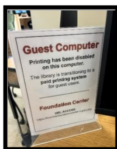
Sign next to designated computers.

AUM has two designated onsite computers near the reference desk on the second floor of the Library Tower. To use these computers, please approach a staff member at the reference desk for login information. After logging in, click the Foundation Center shortcut on the desktop.