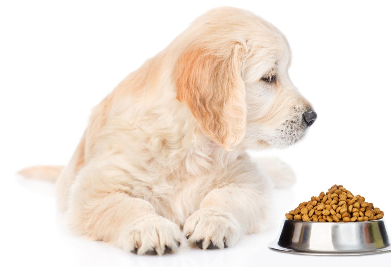
Figure 2. Golden retriever puppy sniffing dry dog food. Font 32.